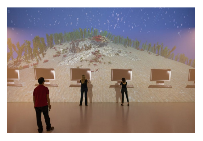
Figure 4. Participants during training.

second condition was the AVO condition (audiovisual + object). Here, subjects listened to the audio recording of the Vimmi items, read the Vimmi and German written word pairs and were then additionally shown the virtual object. The AVOG condition (audiovisual + object picture + grasping), comprised all the elements of the prior conditions, with an additional sensorimotor task: participants were instructed to grasp the virtual objects' contours with both hands. Since the objects were virtual projections, participants had no haptic experience.