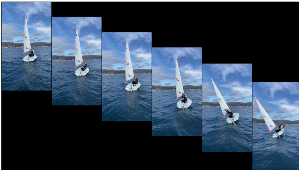
FIGURE 1 Frame sequence extracted from a videoclip showing the sailor performing a turn.

were not significant, \chi^2 = 1.79 , p = 0.410 . Age differences between groups was significant, F(2, 84) = 5.20 , p = 0.007 : Post hoc comparisons showed that the significant difference was between the sedentary ( M = 37.8 years, SD = 16.00 ) and the sailors ( M = 27.5 years, SD = 10.90 ), but neither of them differed from the tennis players ( M = 30.0 years, SD = 10.05 ) (sedentary vs. sailors: p_{Bonferroni} = 0.008 ; sedentary vs. tennis players: p_{Bonferroni} = 0.074 ; sailors vs. tennis players: p_{Bonferroni} = 1.0 ).