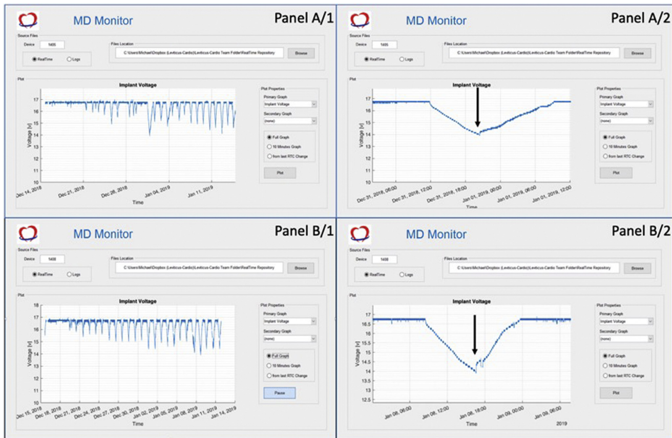
Figure 3 Discharge unholstered performance: (A/1) Patient A and (B/1) Patient B showing daily discharge intervals as a decrease in voltage curve. Maximum discharge test: (A/2) Patient A and (B/2) Patient B showing 8.5 hours until the alarm triggered followed by full battery recharging requiring approximately 6.5 hours. Arrow indicates start of recharge.

Subsequently, a stepwise protocol-based extended daily “discharge-simulation” cycles were conducted (Figure 2 and (Figure 3 Panels A/1, B/1)). Maximum time on unholstered support (Figure 3A/2 and B/2) was attained for 8.5 hours until the first alarm triggered an internal controller vibration and watch buzzer. Such a battery level ensures at least 1 hour of pump operation before a low-capacity, high-alert alarm ensues. Both alarms were actionable as appropriately recognized by both patients and allowed for return to charging safely.