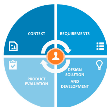
Figure 1. User-centered designed approach. Context: the program manager identifies who are the primary users of the product, how and why they will use it, what are their needs, and which environment they will use the tool. Requirements: when the context is defined, the program manager identifies the detailed requirements of the product, according to the needs of the user. Design solutions and development: once goals and requirements are settled, the ICT professionals and the project manager design and develop the tool for its usability. Evaluate Product: product designers (in this case, ICT professionals) run usability tests to obtain users’ feedback on the product.

Healthcare professionals of the involved working groups agreed on nine minimal fields of interest to preliminarily classify the characteristics of patients’ records in the platform (Table 1) and obtain a quick evaluation of the patients and its possible link to the active and open clinical trials, using breast cancer as a case study.