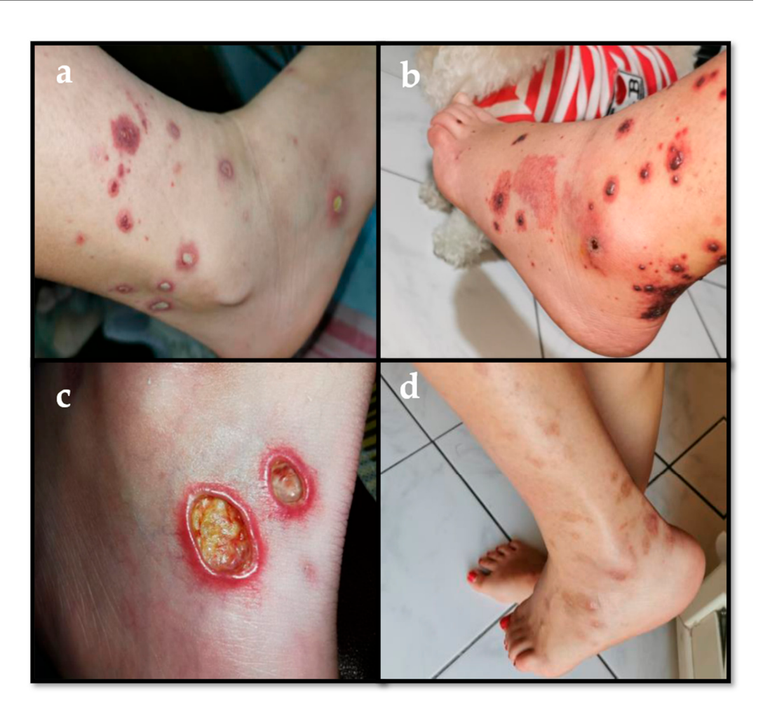
Figure 1. (a) Recurrent palpable purpuric lesions on the legs characterized by reddish-purple spots, some covered with a fibrinous film. (b) Swelling and palpable purpuric lesions on patient's legs, with some haemorrhagic bullous spots. (c) Necrotic-ulcerative lesions on the legs, which were diagnosed as leukocytoclastic vasculitis at the skin biopsy. (d) Scars due to the purpuric and necrotic-ulcerative lesions on the patient's legs.

Accordingly, in consideration of the persistent skin lesions, adalimumab was stopped and the anti-interleukin-12/23 monoclonal antibody ustekinumab (recently introduced in dermatology, especially for psoriasis) started at a dosage of 90 mg every 8 weeks. However, no beneficial effects were seen. In fact, after 15 days from ustekinumab introduction, the purpuric rash turned to necrotic-ulcerative lesions (Figure 1c), and a new punch biopsy was performed, confirming the diagnosis of leukocytoclastic vasculitis.