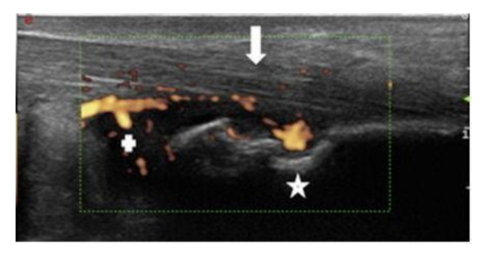
Figure 1 PDUS scan of an Achilles' enthesis complex showing enthesitis (erosion of calcaneum with Doppler signal (star)), tendinitis (arrow) and bursitis (+). PDUS, power Doppler ultrasonography.

The technical parameters of the devices were the following: Linear probe 10–14 MHz, Doppler frequency 14.1 MHz, PRF 500 Hz.