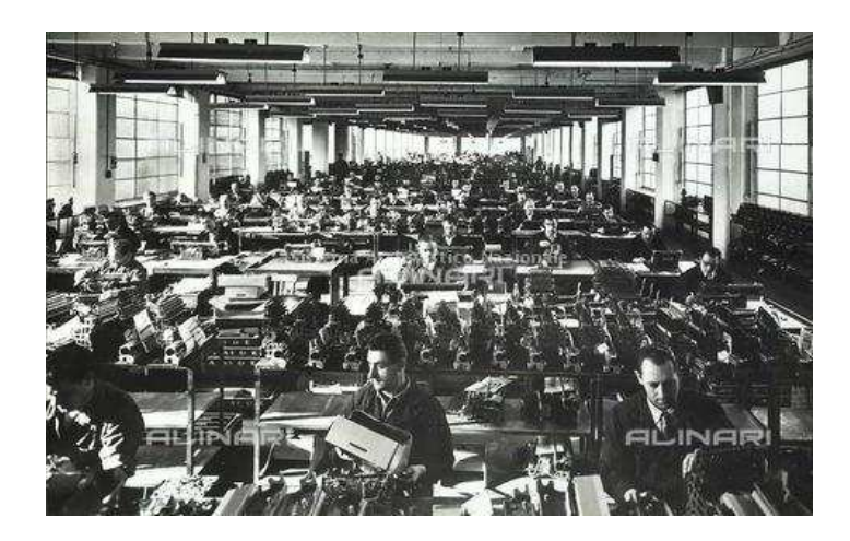
Figure 2: Olivetti, Ivrea, 1955-60. "Associazione Archivio Storico Olivetti" - Ivrea, Italy<sup>i</sup>