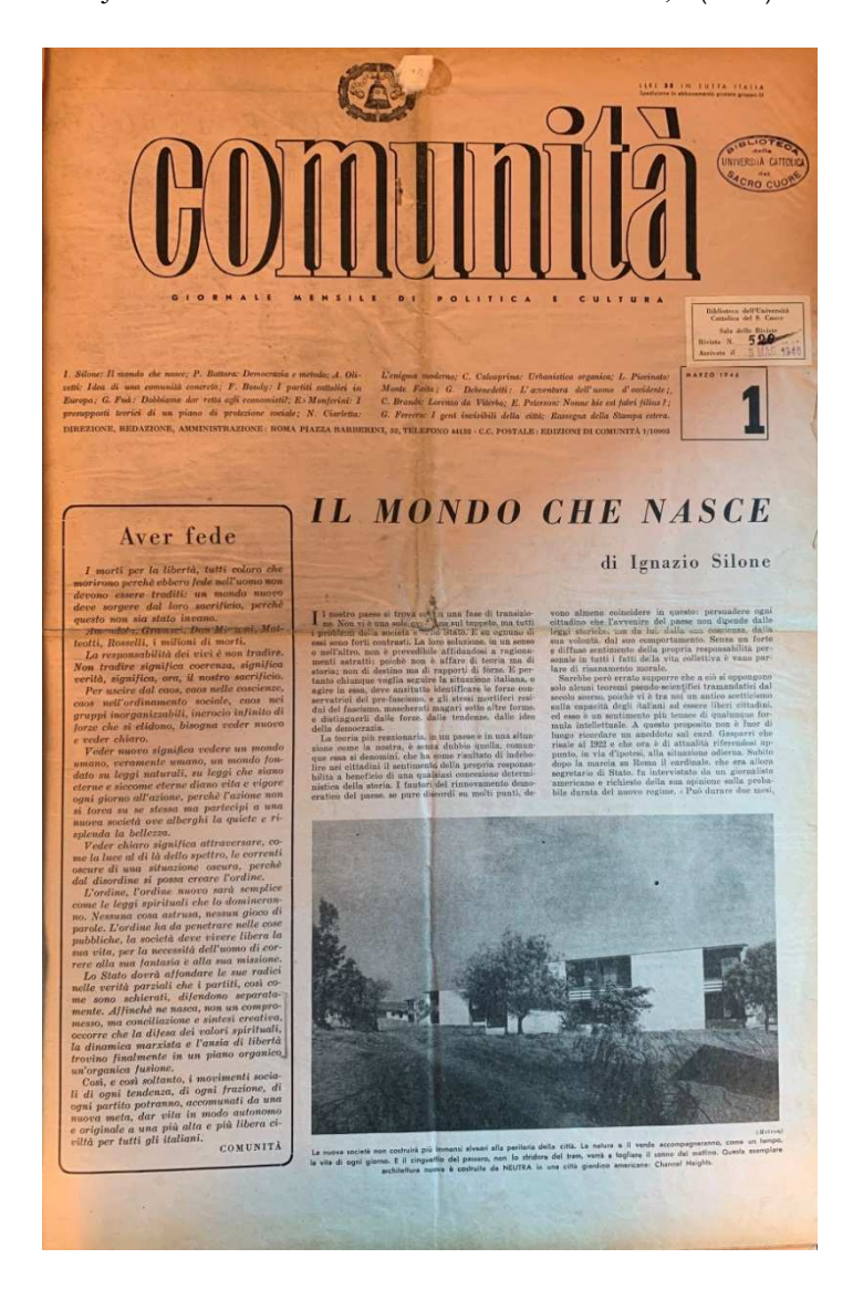
Figure 1: the first issue of monthly Comunità (Comunità. 1946, 1 (1), p. 1)