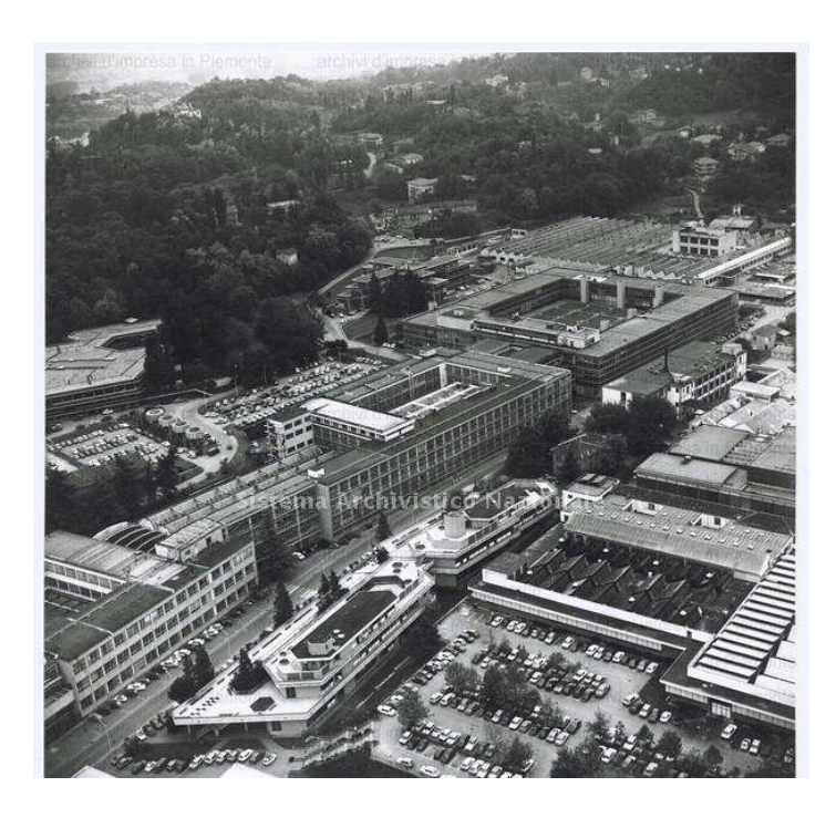
Figure 3: Olivetti, Ivrea. "Associazione Archivio Storico Olivetti" (Ivrea, Italy)<sup>ii</sup>