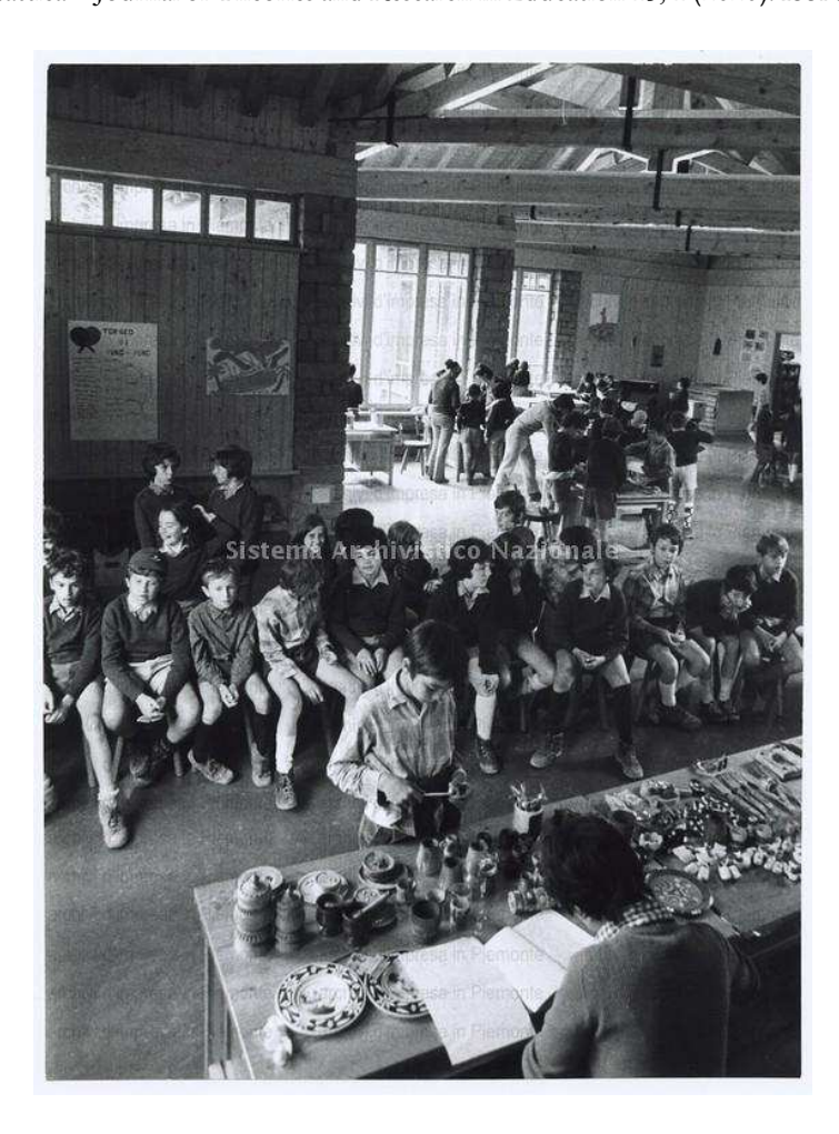
Figure 5: Champoluc summer camp. "Associazione Archivio Storico Olivetti" (Ivrea, Italy)iv