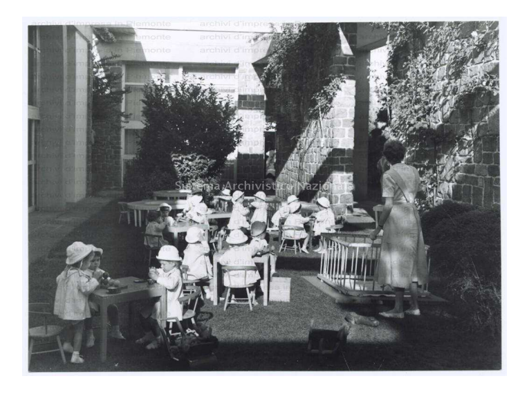
Figure 6: nursery school.<sup>v</sup>