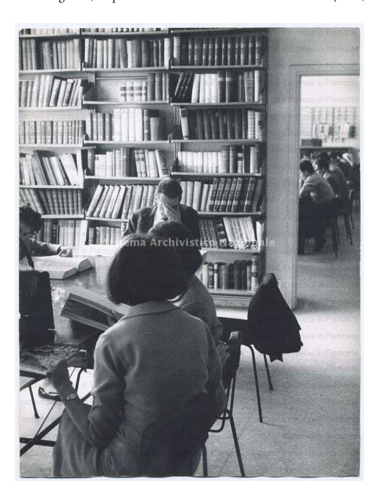
Figure 8: library. "Associazione Archivio Storico Olivetti" (Ivrea, Italy) vii