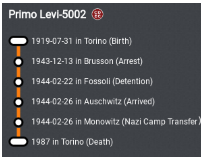
Figure 4. Metro-like visualization

movements of all the Shoah survivors having sales occupations: filters are displayed on the right, victims resulted from the query are listed below the filters and places can be searched using the search field at the top of the map. Furthermore, a timeline is at the bottom of the interface together with a legend explaining the match between trajectory color and the value of the death_description property. Trajectories have a black arrow indicating the route destination. The marker flagging each location can be clicked to see the list of people that passed through that place. Aggregated information can also be zoomed in to analyse the life and destiny of a single person. For example, Figure 4 presents how the content related to Primo Levi is displayed by using a metro-like visualisation. The fly-over functionality is activated by clicking on a single event in the list, which automatically displays a detailed view of the place where the event occurred.