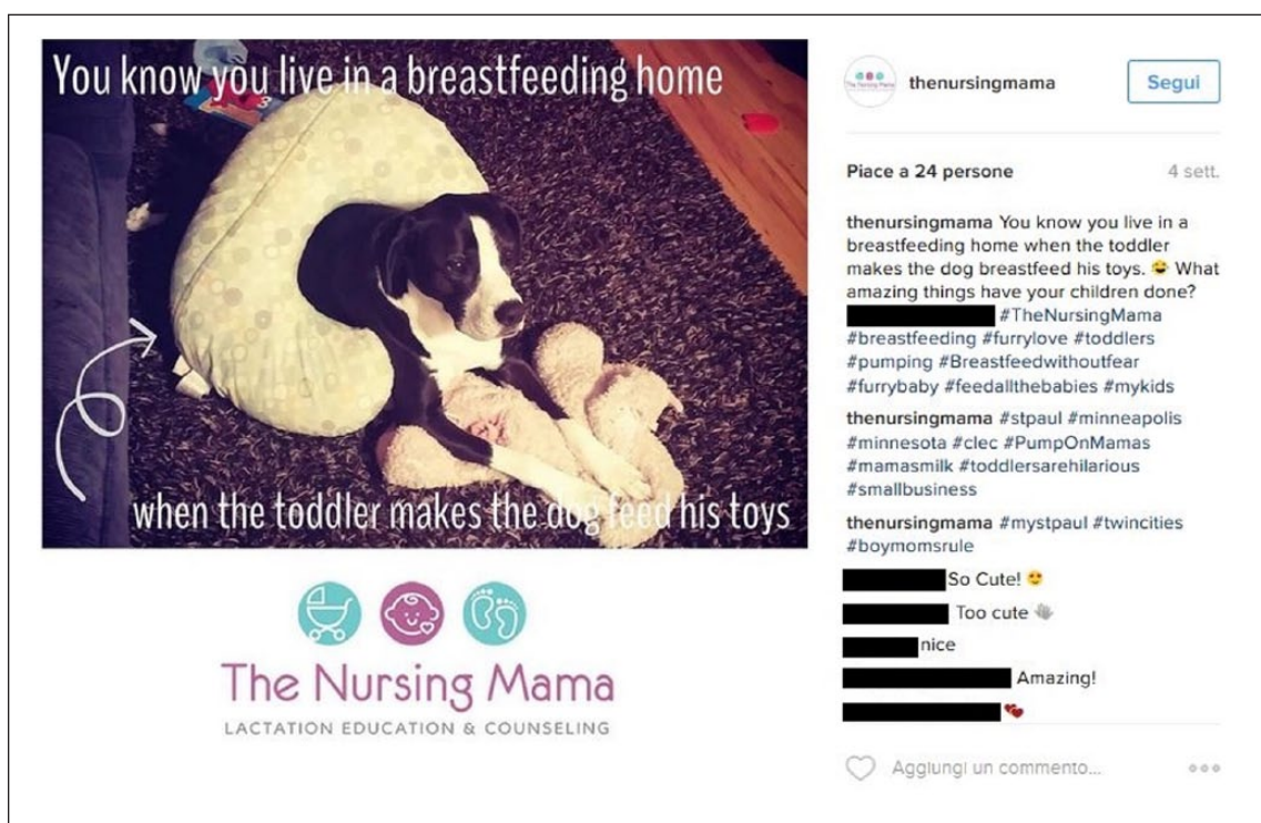
Figure 2. An example of captioned image shared by @thenursingmama, screengrabbed July 2016.