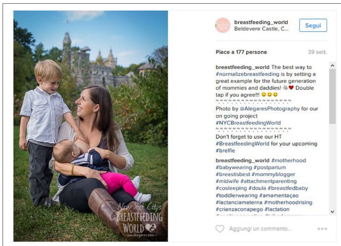
Figure 1. A picture from @breastfeeding_world, screengrabbed July 2016.