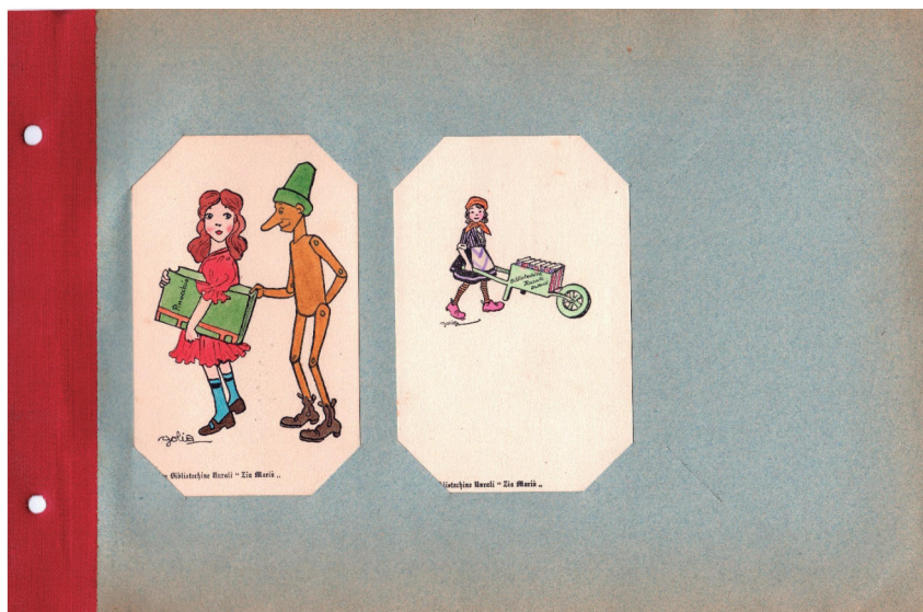
Image 5. Album, doc. 42, Zia Mariù collection, MUSLI, https://www.fondazioneTancrediBarolo.com/bibliotechine-di-zia-mariu (accessed on 10.10.2022)