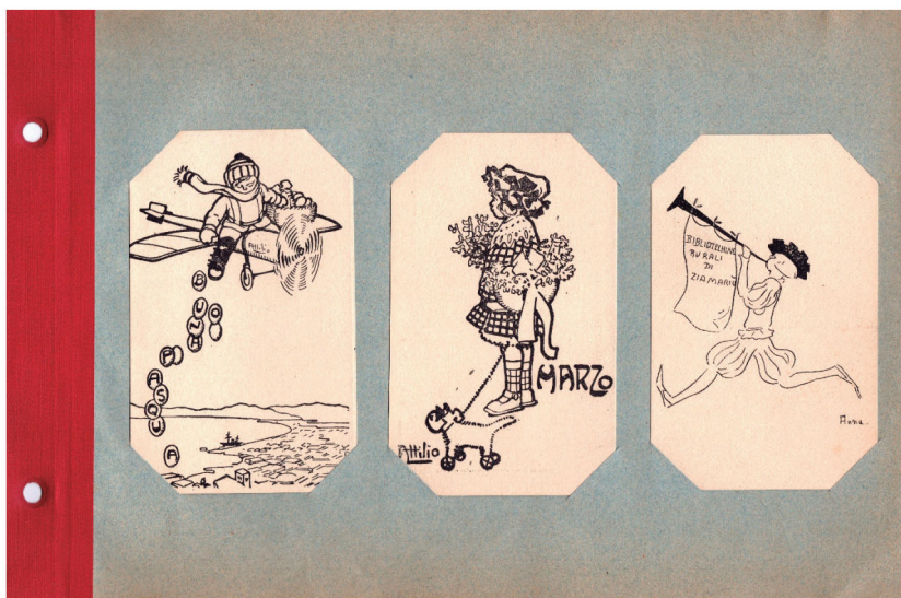
Image 6. Album, doc. 67, Zia Mariù collection, MUSLI https://www.fondazionetancredidibarolo.com/bibliotechine-di-zia-mariu (accessed on 10.10.2022)