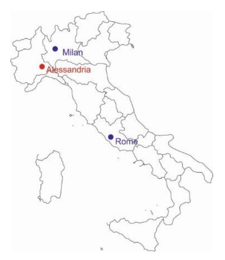
Figure 1. Localization of the study area.

prominence; this role is marked by the success of Stralessandria, an annual charity event that includes a competitive 6 km run and a non-competitive run/walk through the streets of the city center. Stralessandria has been organized from 1995 onwards, and there were over 10,000 participants when it was most recently held, in 2019 (www.stralessandria.it). While it is possible to meet joggers around the city, one of the favorite places for jogging is along the embankments of the Tanaro river: early in the morning and particularly at the end of the day one can count several people jogging along the 10 km track. Other favorite places are on the peripheries of the city, such as in the industrial area D3, in the western outskirts, or in the rural suburbs, such as around Valle San Bartolomeo.