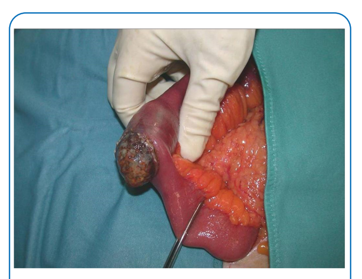
Figure 2: Extraction of the gallstone from the distal ileum.