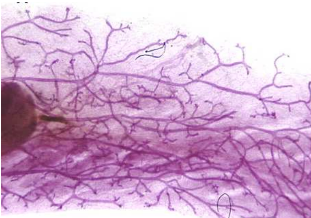
Figure 3. Carmine-stained whole mounts of a section of mammary gland : in violet the epithelial tissue and its ducts, in white the stroma.

The number and location of mammary glands vary strongly between different species, but the structure and cellular composition is very similar. This organ is constituted from two tissue compartments: the epithelial one, that will give origin to ducts and to milk-producing alveolar cells, and the connective one (stroma or mammary fat pad) composed of adipocytes, fibroblast, cells of the haematopoietic systems, blood vessels and also neurons (see review: Hennighausen and Robinson, 2005) (figure 3).