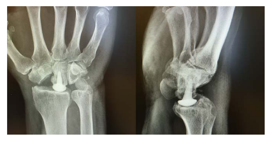
Figure 2. Follow-up antero-posterior and lateral x-rays with RCPI implanted.

Table 1. Number of patients selected in each article, the diagnosis of those patients when specified, the sex, the mean age in years and mean follow-up in months.