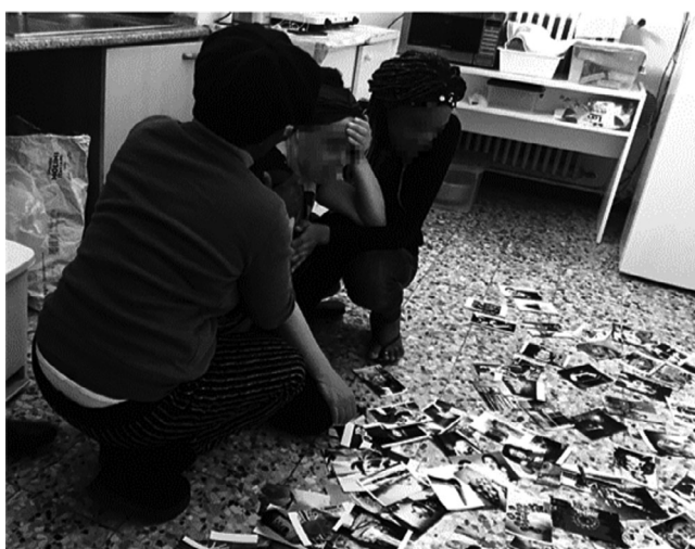
FIGURE 2 A photo of some participants during a group meeting